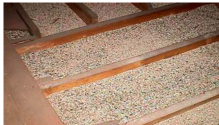
Vermiculite insulation between attic joists